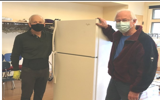
...and VSMC volunteers completed the delivery.