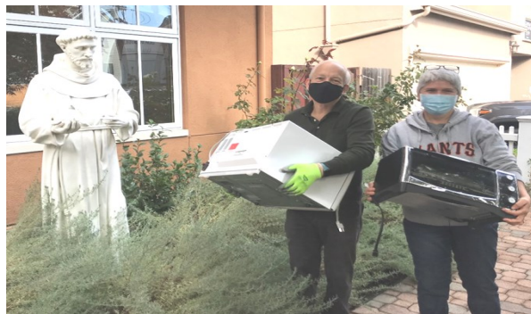
Volunteers from the St Francis Center...